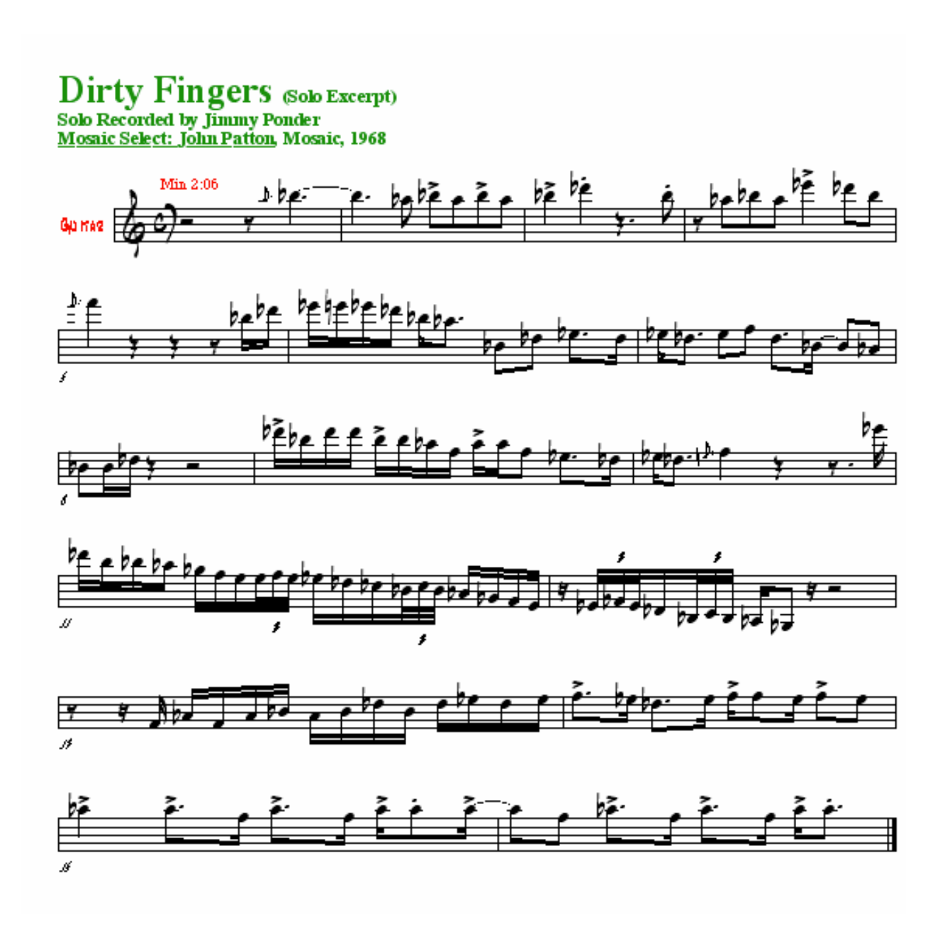
Figure 1 Solo Excerpt from "Dirty Fingers."