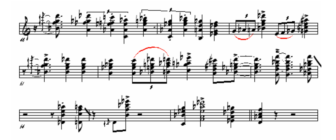
Figure 5 Melody and Partial Solo Transcription of "J.P."

After stating the melody twice, Ponder begins to improvise using block chords. To balance the rhythmic and harmonic aspects of playing solo guitar, Ponder develops new melodies or themes, which he transposes to fit the chord changes. His improvised melodic lines, in this context, are thematic and highly syncopated. These lines are harmonized within the context of the chord progression but follow a pattern of harmonic preparation and resolution. Ponder uses preparation and resolution, or as he calls it, question and answer, and call and response, to create a personal dialogue. He does this by embodying different "voices" and playing them off one another. Each "voice" represents a part of the ensemble. Melodic content conjures the sound of lead instruments, block chords the sound of harmonic instruments, and octaves the sound of the drums. Balancing these "voices" is crucial for maintaining the energy and focus of the song, just as it is in the ensemble setting. If one "voice" predominates, then the "dialogue" collapses and the song loses meaning as a socially interactive event.