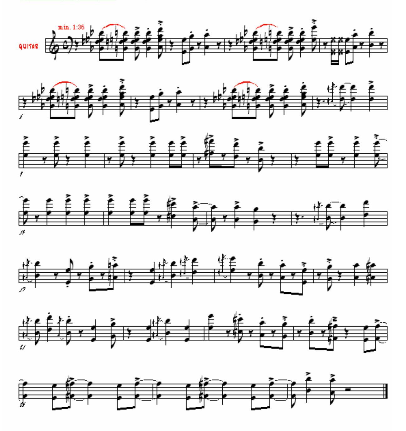
Figure 2 Solo Excerpt from "Minor Swing"

Minor Swing Solo recorded by Jimmy Ponder Mosaic Select: John Patton, Mosaic, 1968