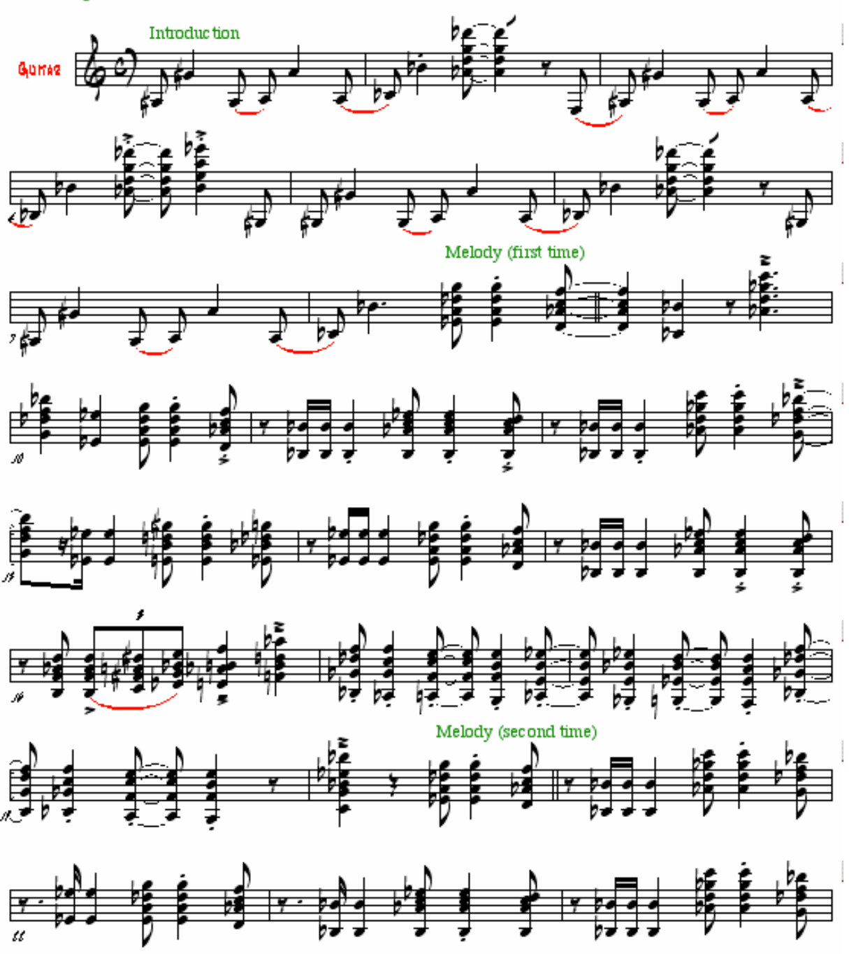
J.P. Recorded by Jimmy Ponder Alone, HighNote, 2000